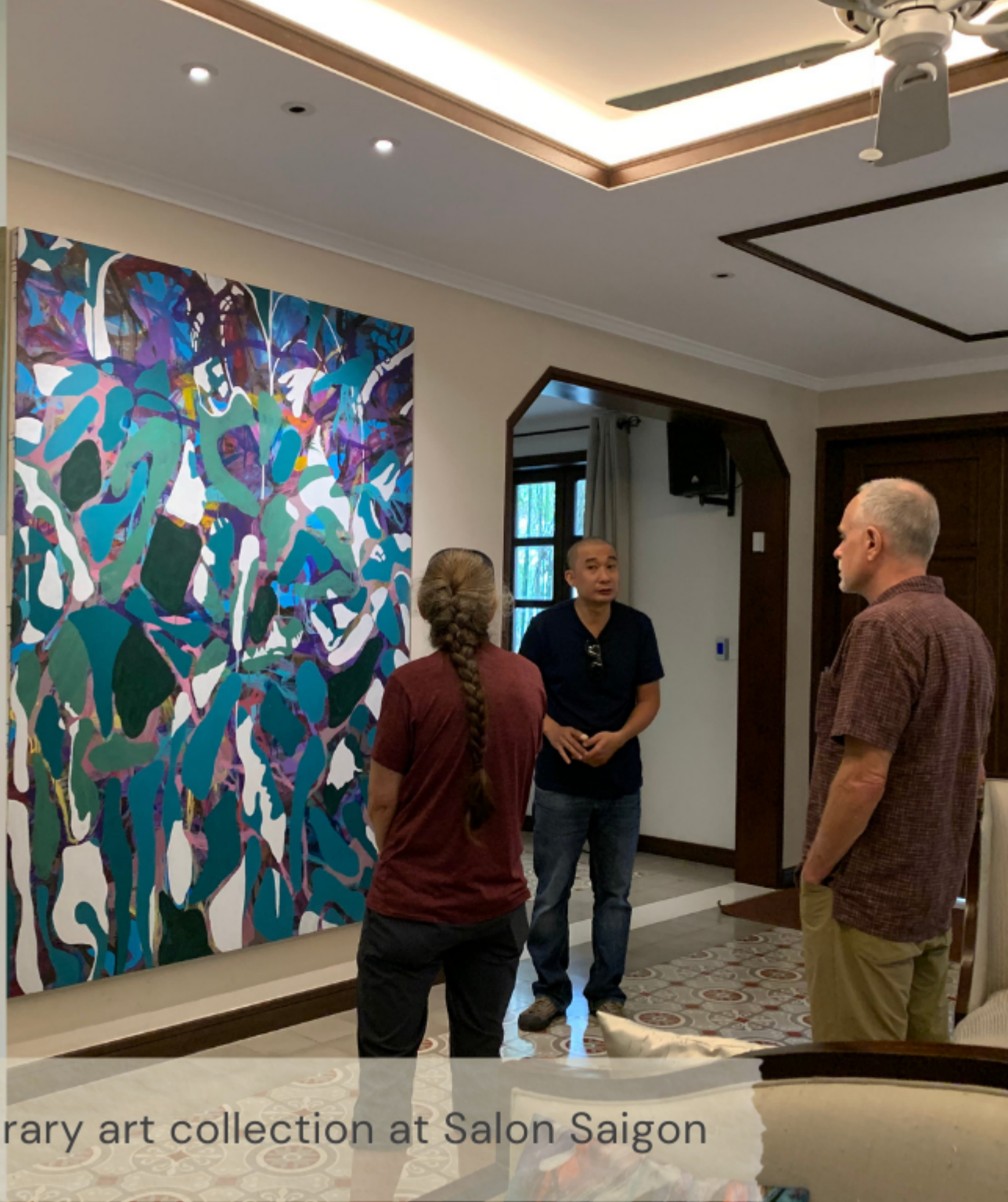
Short introduction about Contemporary art collection at Salon Saigon