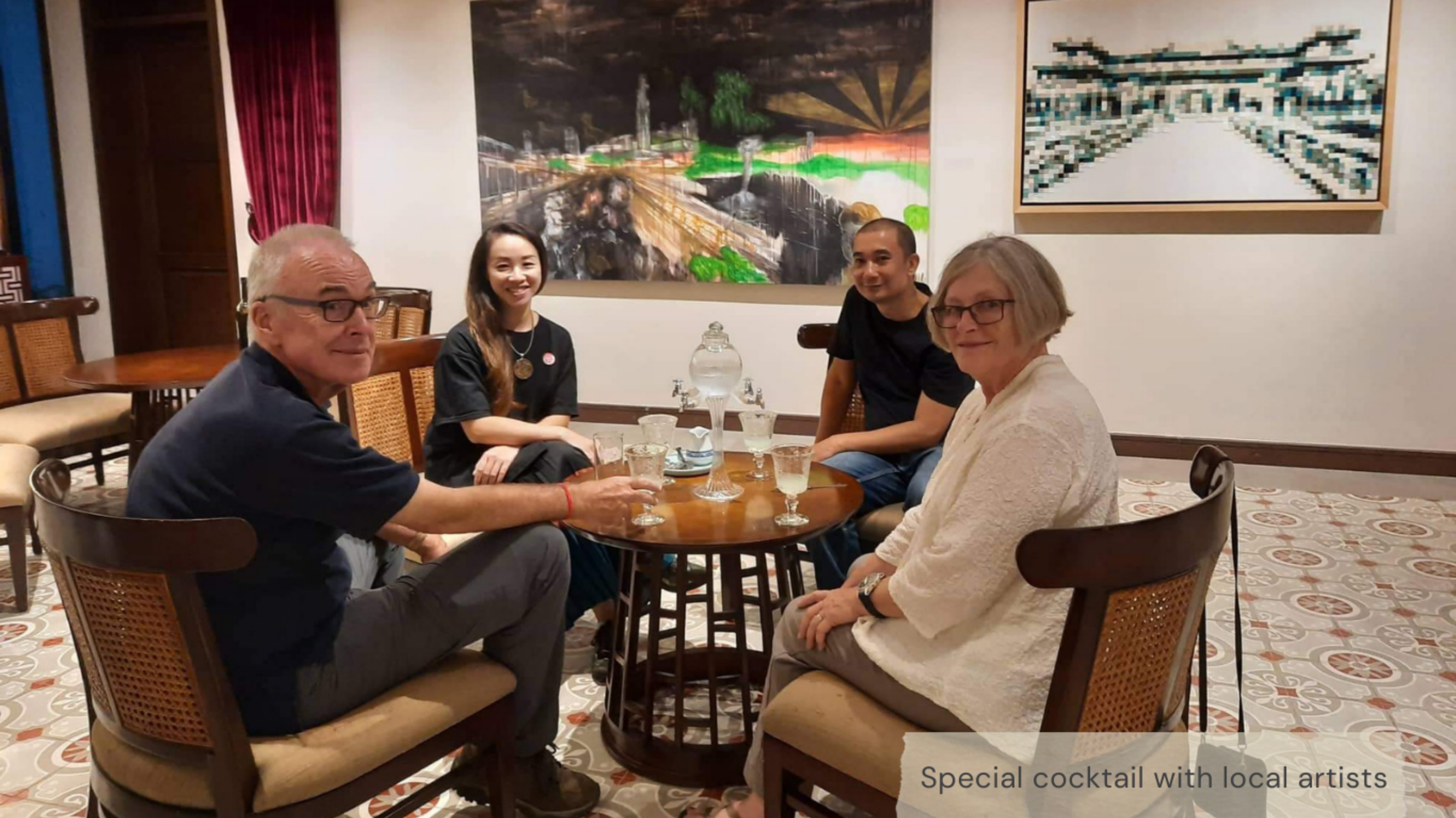
Special cocktail with local artists