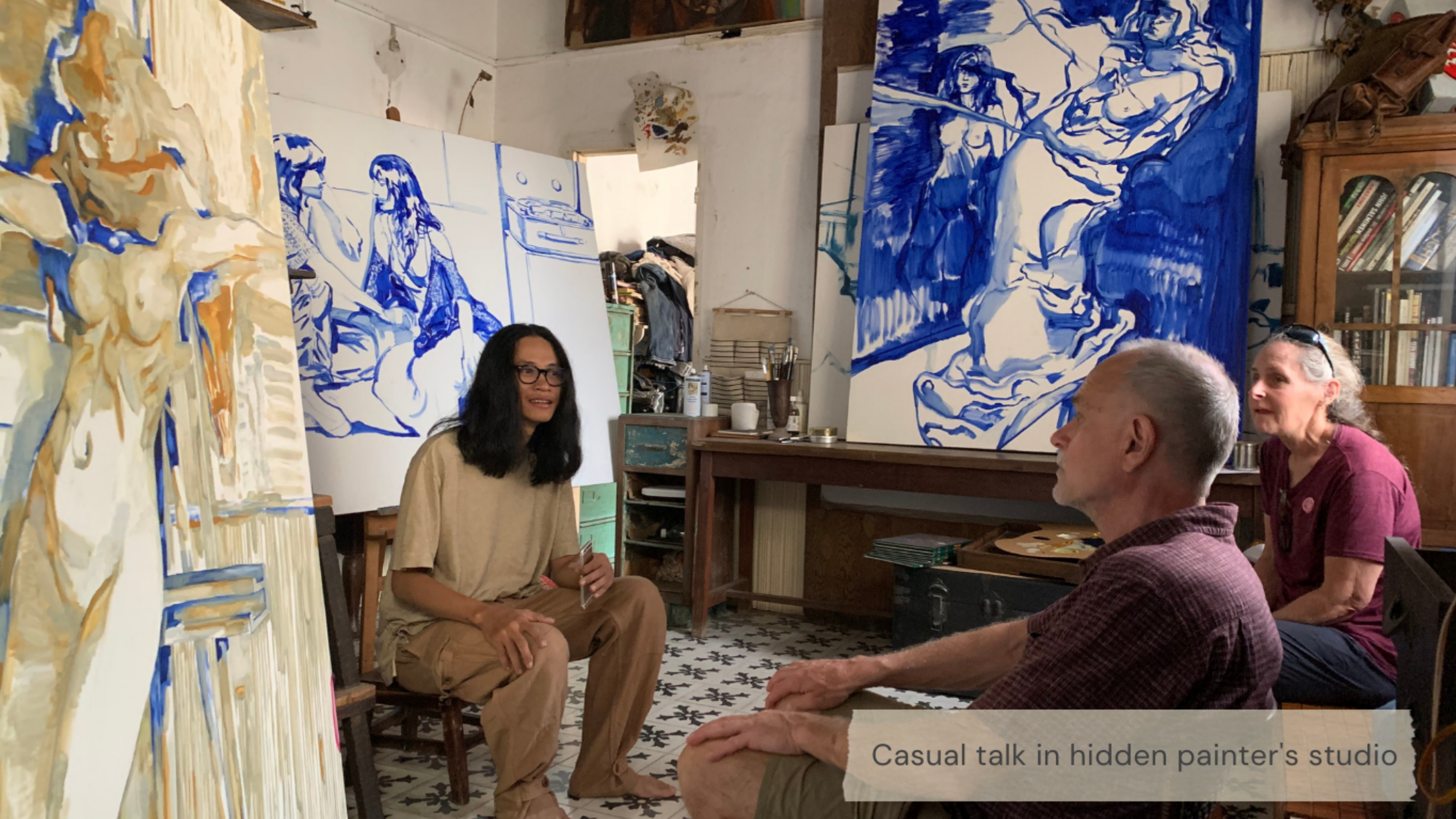
Casual talk in hidden painter's studio